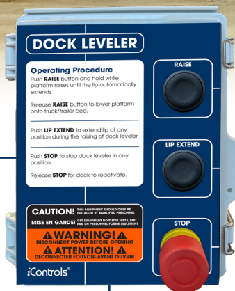
Three-Button Dock Leveler Panel